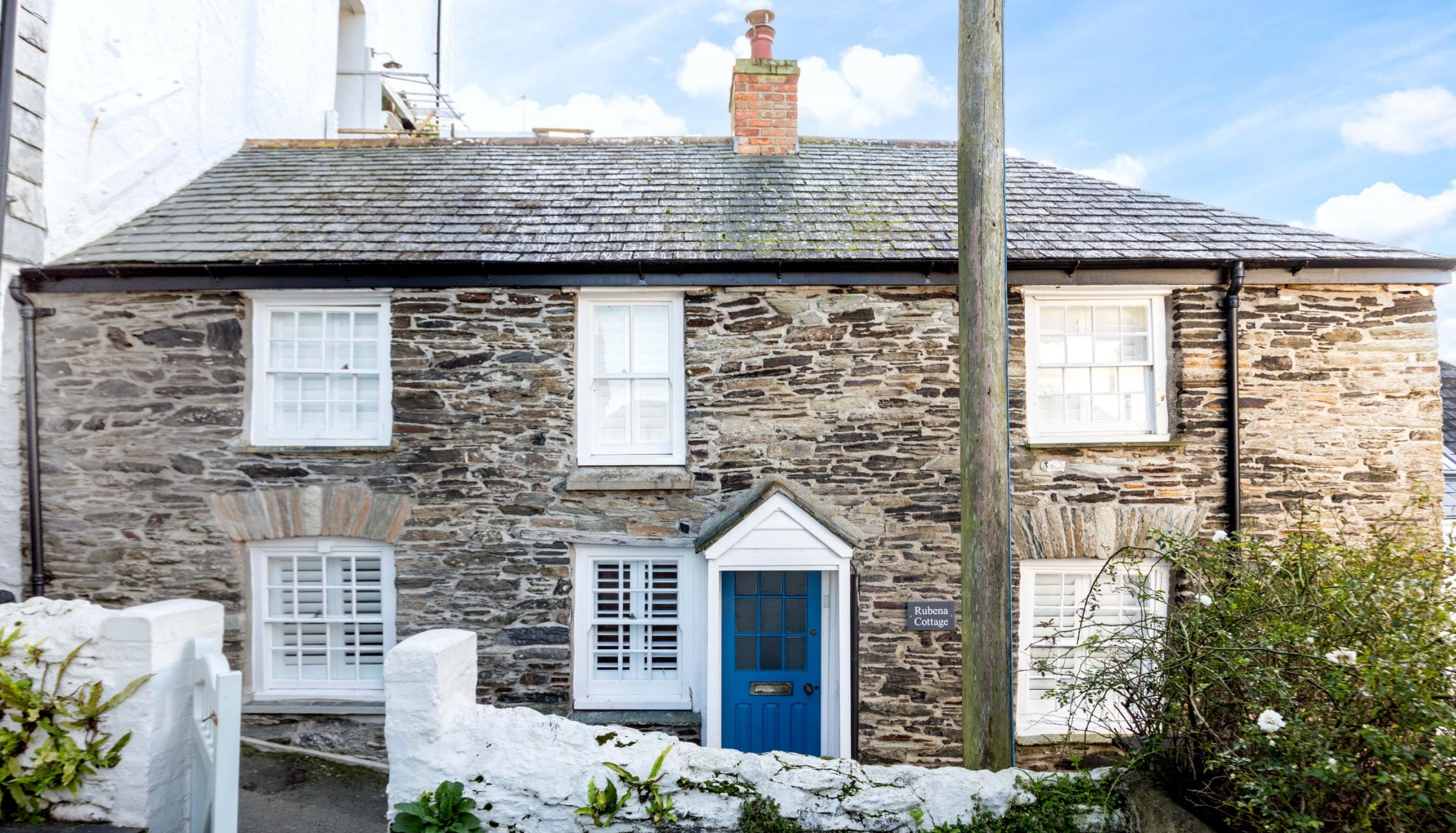
Rubena Cottage 36 Dolphin Street, Port Isaac Guide Price: £495,000