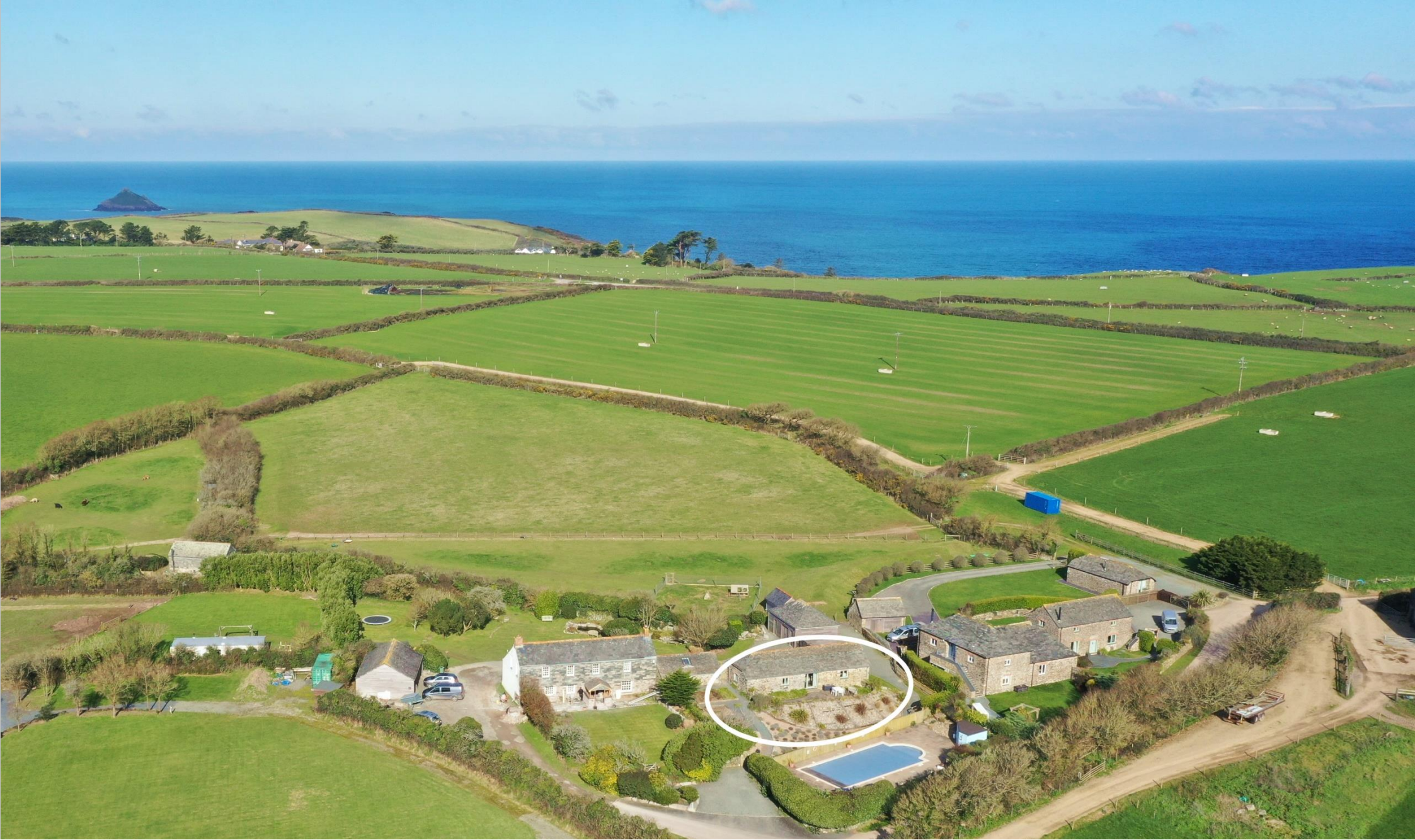
The Calf's House Mesmear, Nr Polzeath